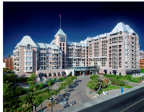
Hotel Grand Pacific

Please join us and invite your friends to be friends with "Victoria Chinese Messenger" to help grow our friends and checkout our facebook page to support our efforts to bring community to you. We are always looking for more fans. Becoming a fan of VCM facebook page automatically enters for the monthly draw for dinner for two.