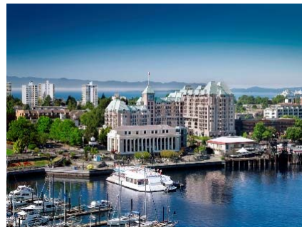
Harbourview of Hotel Grand Pacific